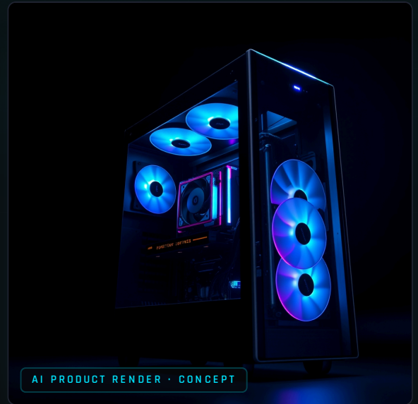
AI PRODUCT RENDER · CONCEPT

JumaPCTech makes something genuinely good — hand-built custom gaming PCs , a real tier lineup, real people behind the support. The gap isn't the product. It's that the brand doesn't show it yet. We put together a concept to show what it looks like when the visuals match what you're actually selling.